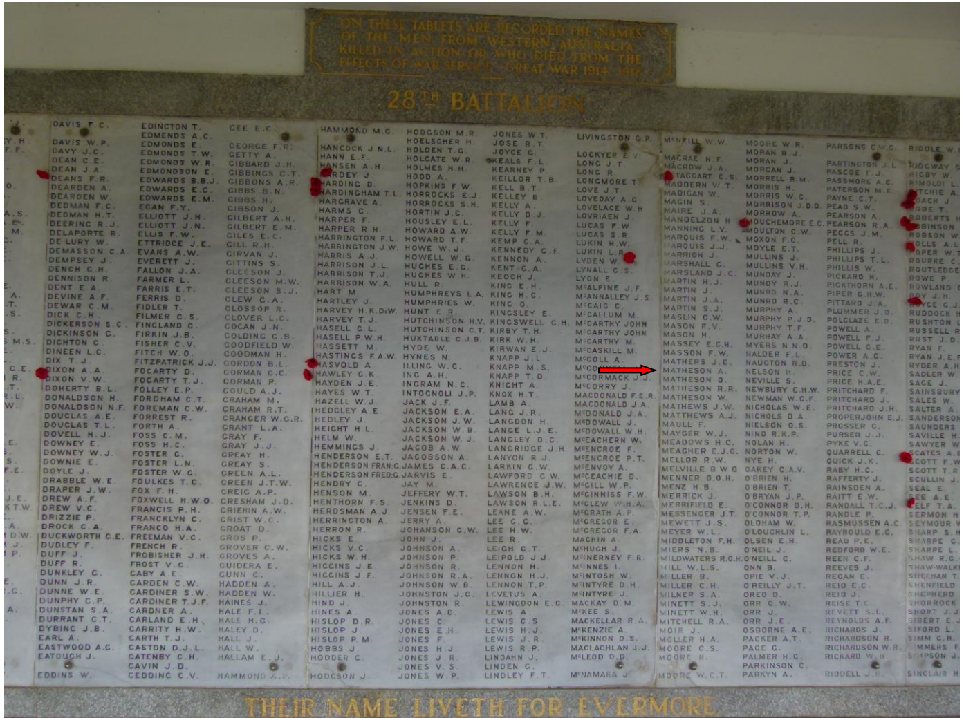
28th Battalion Panel